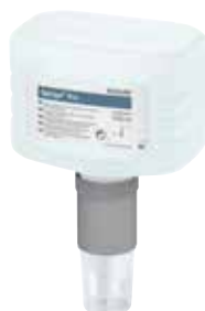
Spirigel Pro Nexa 750ml