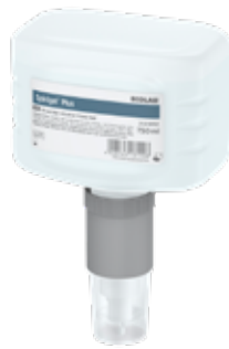
750ml Nexa Cartridge