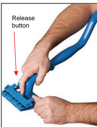
1. Push release button and pull up on hinged top