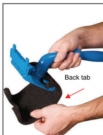
2. Secure pad by inserting it onto back tabs