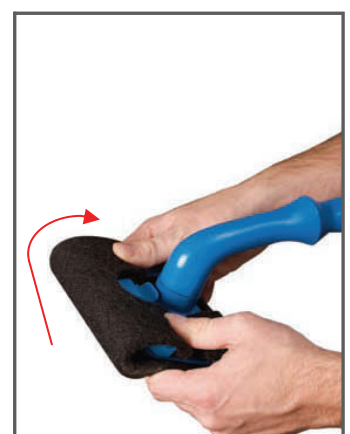
4. Snap hinged top closed